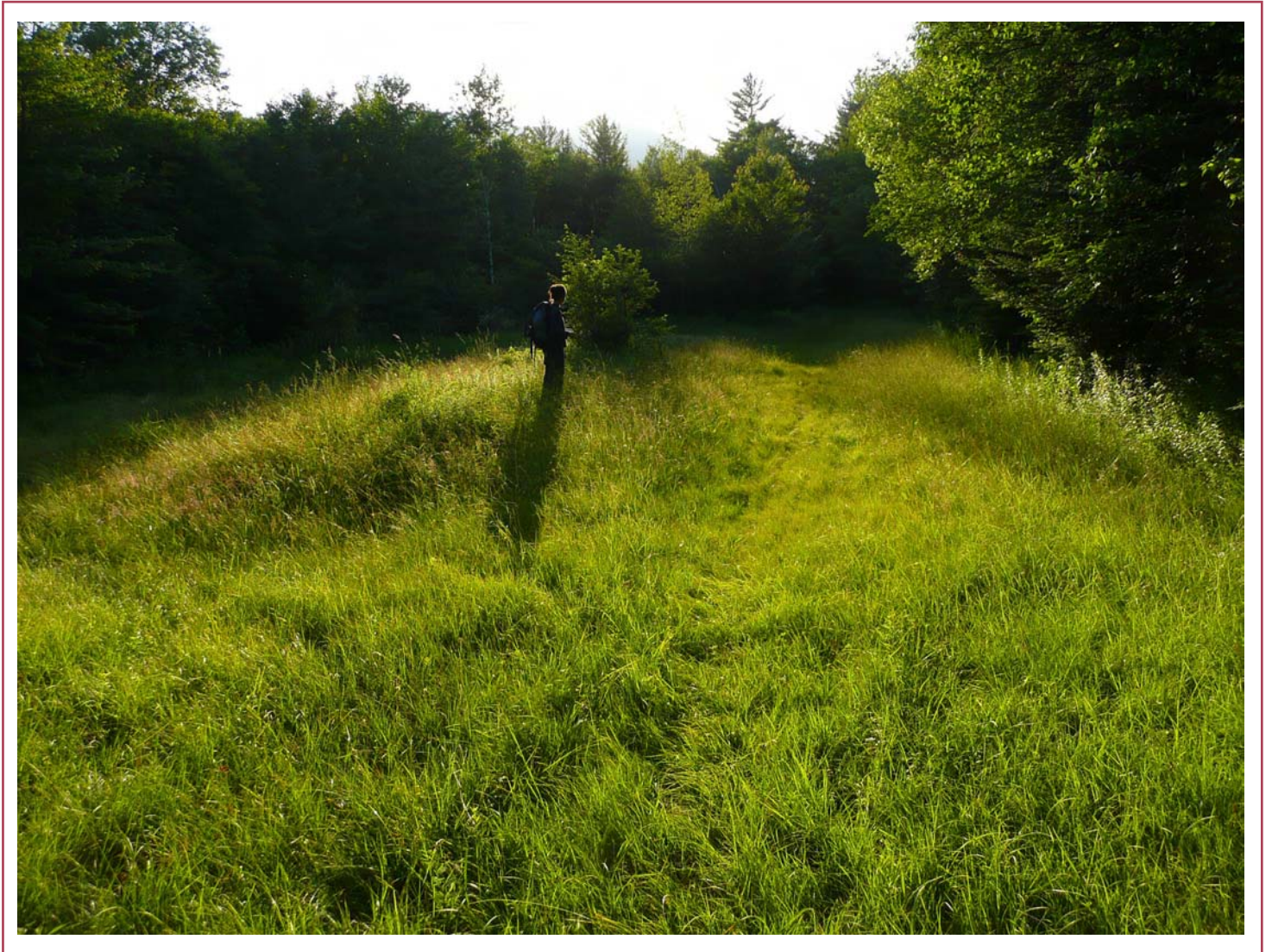
Lost Pass in the Sandwich Range Wilderness - Where woman herself is a visitor who does not remain . . .