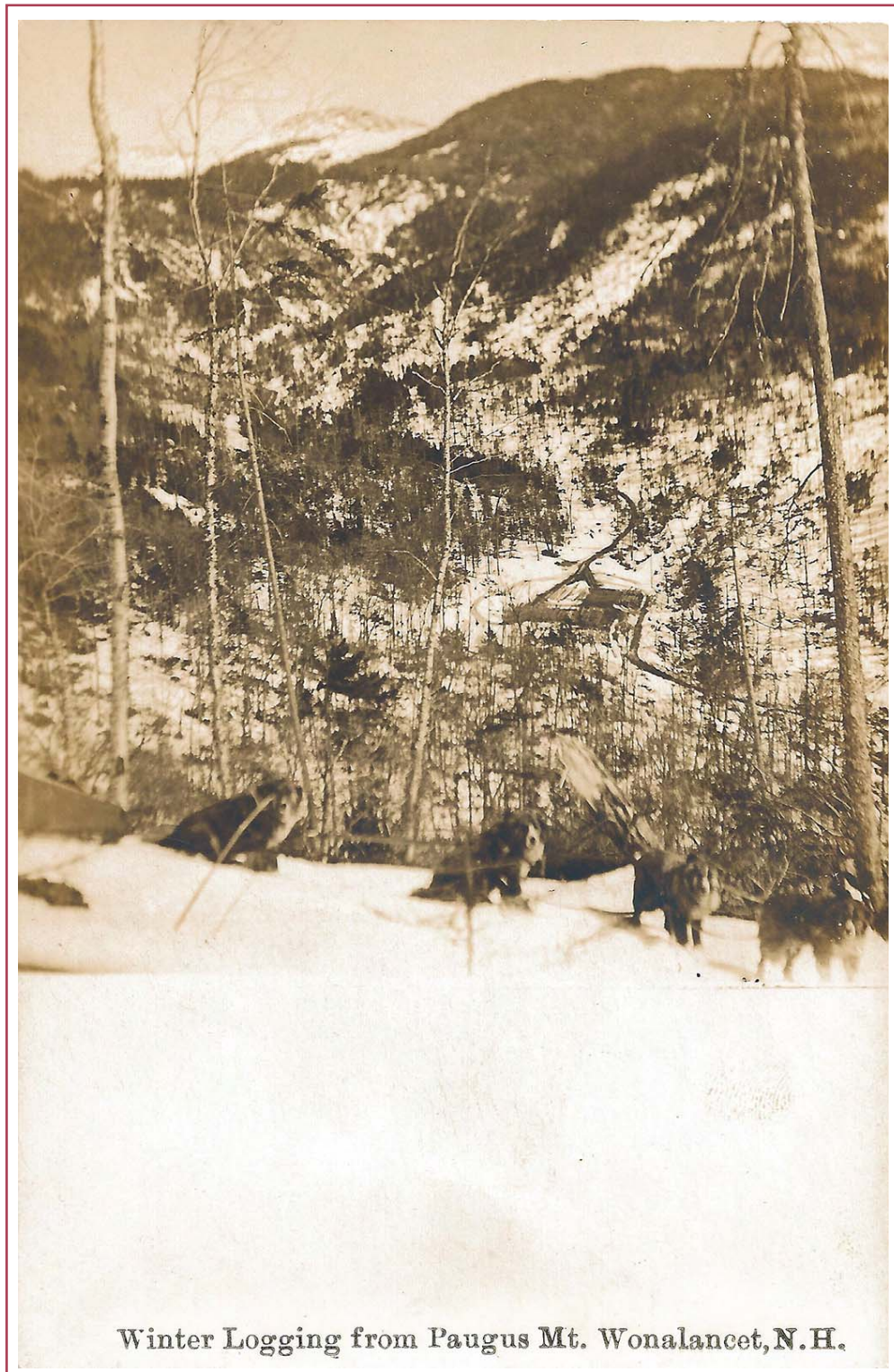
Winter Logging from Paugus Mt. Wonalancet, N.H.

Illustrations for “Wilderness is a People Thing”